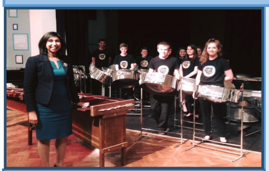
Pan Jazz International