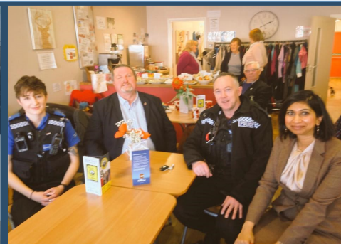
Police beat surgery- Highlands Hub

To stay up to date with all of my recent visits and speeches in parliament please visit my website.